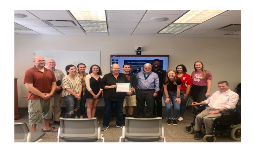
October meeting group picture