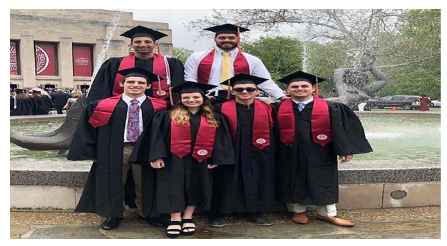
May 2019 graduates pictured above

"If you take responsibility for yourself, you will develop a hunger to accomplish your dreams".